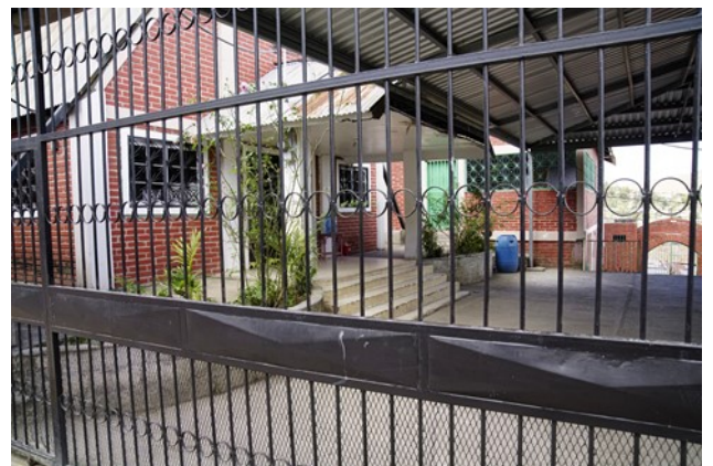
Fuerzas UMC and Clinic