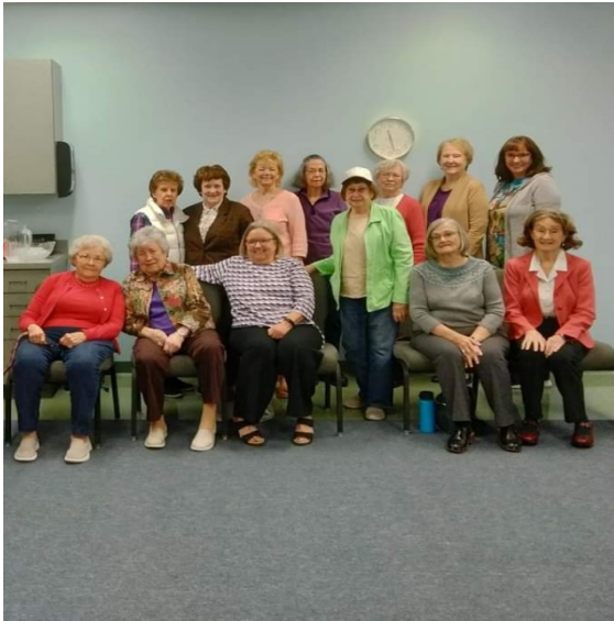
Faith and Variety Circle