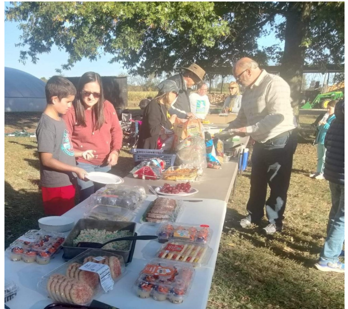
Happy Jack's Potluck Picnic