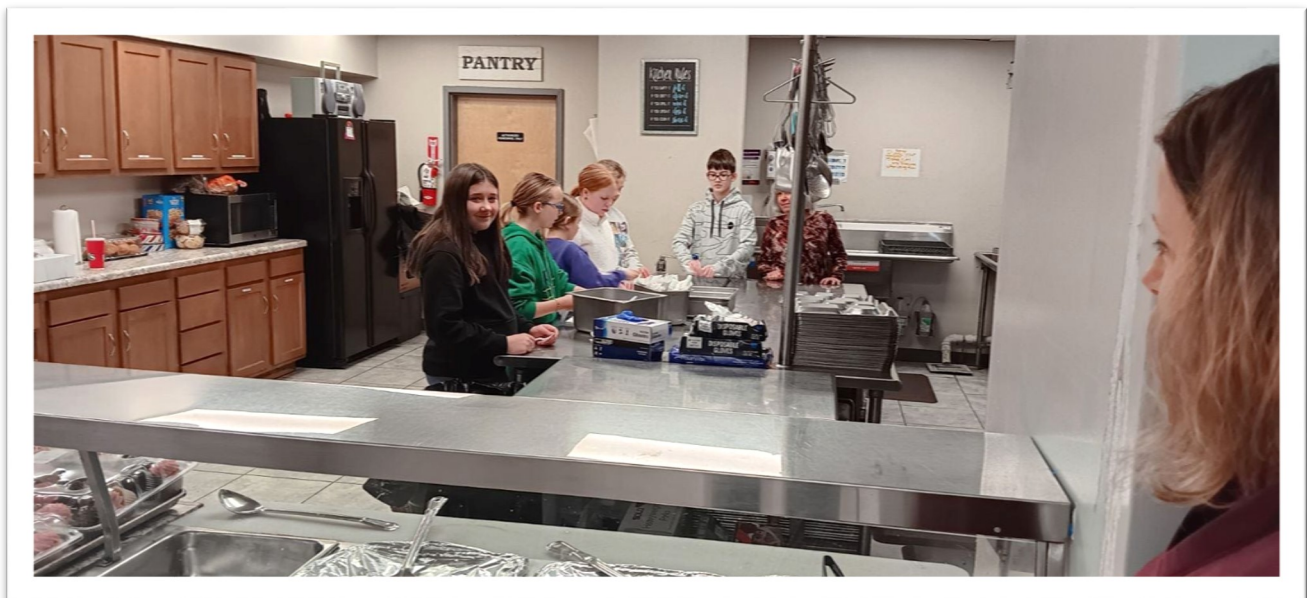
FISH (First in Serving Him) recently helped at the Access Soup Kitchen.

We are excited to announce that with new grant funding and community support like what we receive from First United Methodist Church, we have been able to hire a part-time Family Support and Enrichment Specialist to focus solely on families with children enrolled in our programs.