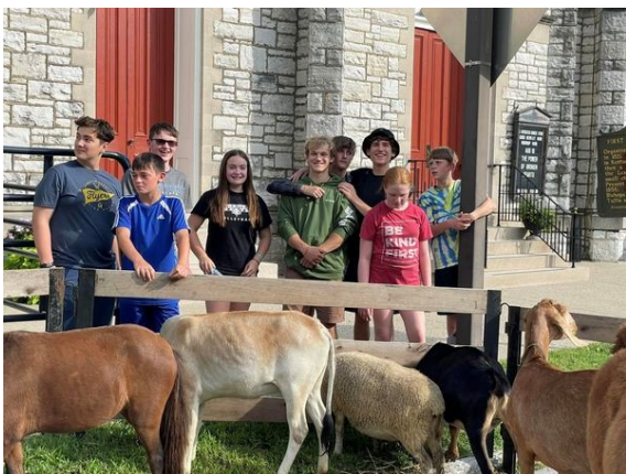
Pix from First Spark Pop-Up Zoo